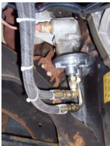
Connection to engine adapter