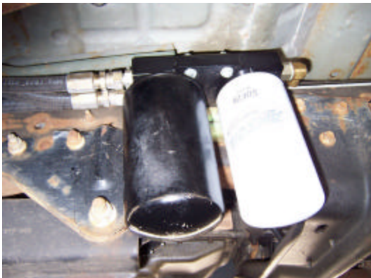
Filters mounted on frame rails

Everything seems to be working fine and I am very happy with the way things look.