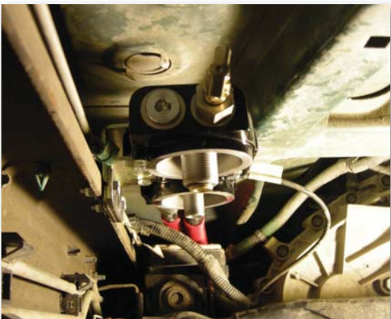
BY-PASS UNIT INSTALLED WITH OPTIONAL OIL SAMPLING PORT (BK13).

The Dual Remote Filtration System (BMK27) was installed on a 2005 Chevrolet Silverado with a 6.6L Duramax engine. Despite the many parts that come with the kit, anyone with a reasonable amount of do-it-yourself skills can install this unit.