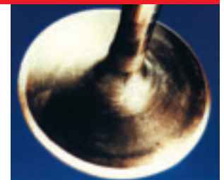
Treated with AMSOIL P.I.