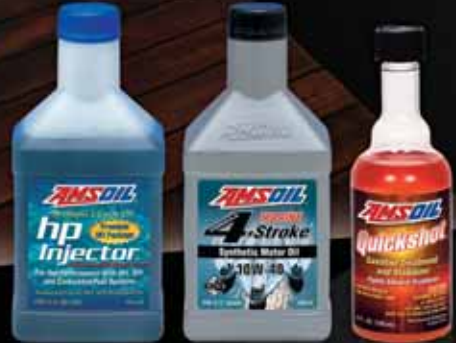
SYNTHETIC 4-CYCLE OILS