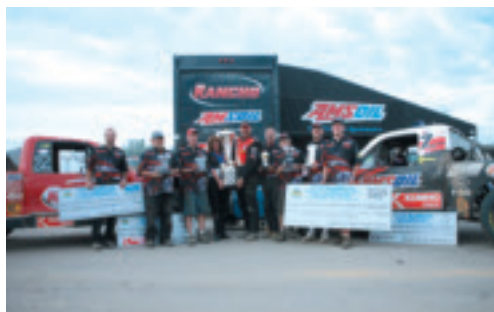
It took a big team to haul out the hardware at Crandon.