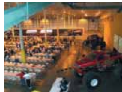
AMSOIL U Race Night from above.