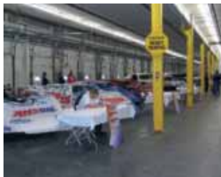
Twenty-two cars, trucks, boats, bikes and sleds were put under the AMSOIL Center roof this year.