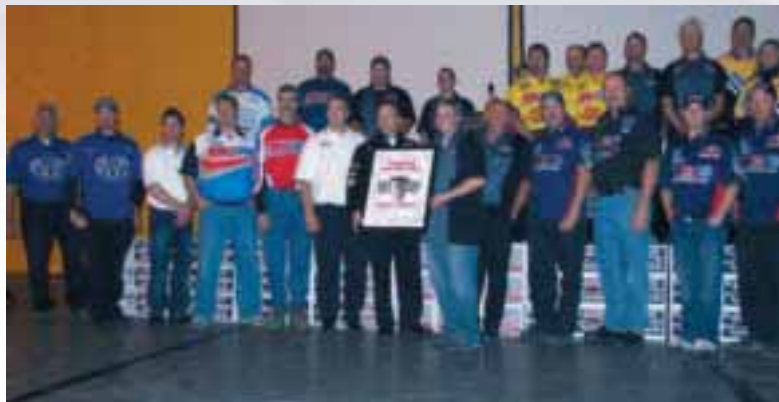
Team AMSOIL took center stage to a standing ovation.