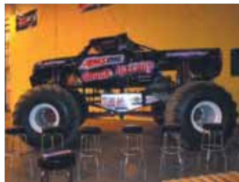
The AMSOIL Shock Therapy Monster Truck returned to AMSOIL U for the second straight year.