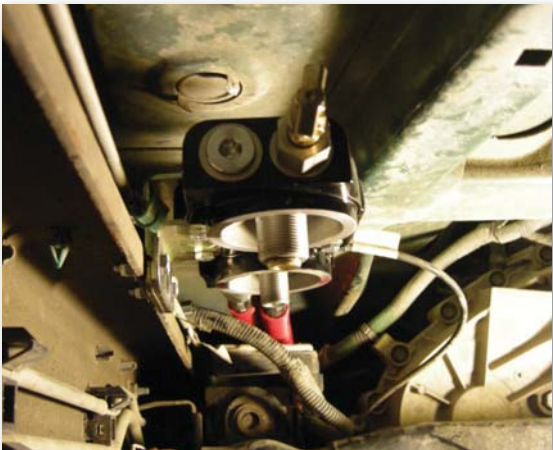
BY-PASS UNIT INSTALLED WITH OPTIONAL OIL SAMPLING PORT (BK13).

The Dual Remote Filtration System (BMK27) was installed on a 2005 Chevrolet Silverado with a 6.6L Duramax engine. Despite the many parts that come with the kit, anyone with a reasonable amount of do-it-yourself skills can install this unit.