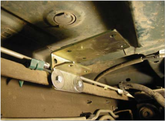
FILTERS REMAIN SAFELY ABOVE THE BOTTOM OF THE FRAME WITH THIS BRACKET LOCATION.

AMSOIL Dual Remote Filtration System Submitted by Ron Fisher