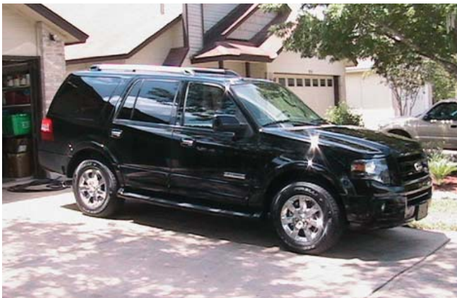
2008 Ford Expedition 5.4L V8 2WD

The Dual Remote Filtration System (BMK23) was installed on a 2008 Ford Expedition equipped with a 5.4L V8. Since it's 2WD, there is a lot of room for mounting in front of the axle, behind the front bumper. The kit comes with all the necessary hardware, but I custom made part of the bracket in order to fit it where I wanted. A spin-on adapter was used to attach the feed and return lines to the engine. Installing the system behind the front bumper requires no more than 18" of hose for either line. The EaO15 Full Flow Filter and EaBP90 By-Pass Filter used sit well above the frame rails and are easy to get to. System capacity increased from seven quarts to almost nine.