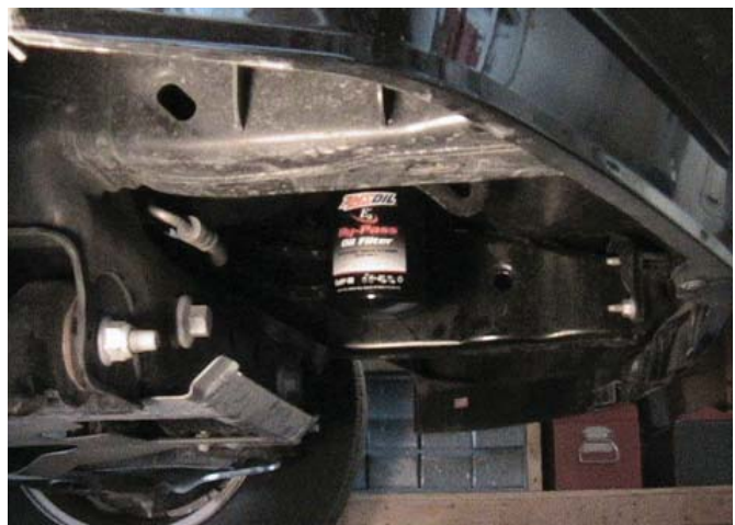
Filters are easy to access and sit well above the frame rails.

Disclaimer: These installation examples have been submitted by sources independent of AMSOIL INC. and may not comply with AMSOIL INC. installation instructions or application recommendations.