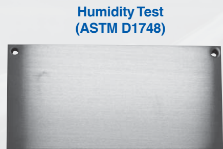
AMSOIL Firearm Cleaner (no corrosion)