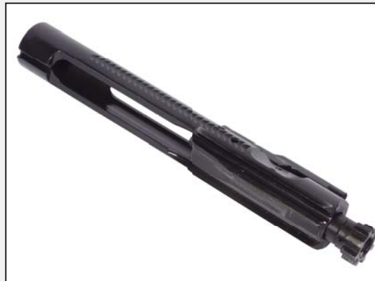
AMSOIL Synthetic Firearm Lubricant provided exceptional performance over rigorous range testing in multiple firearm applications.