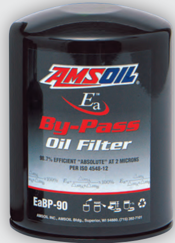
EaBP90 • EaBP100 • EaBP110 • EaBP120

AMSOIL Ea Bypass Oil Filters provide maximum filtration protection against wear and oil contamination. Working in conjunction with the engine's full-flow oil filter, AMSOIL Ea Bypass Filters operate by filtering oil on a "partial-flow" basis. They draw approximately 10 percent of the oil sump's capacity at any one time and trap the extremely small, wear-causing contaminants that full-flow filters can't remove. AMSOIL Ea Bypass Filters typically filter all of the oil in the system several times an hour, so the engine continuously receives analytically clean oil.